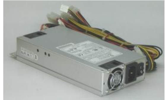
Dimension ( W x L x H ) : 200 x 100 x 40.5 mm